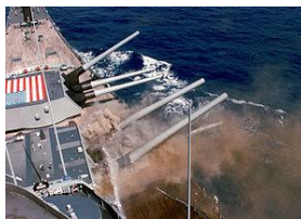
USS Iowa's Turret Two explodes