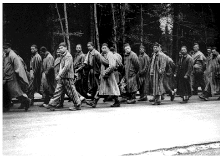
Dachau Death March