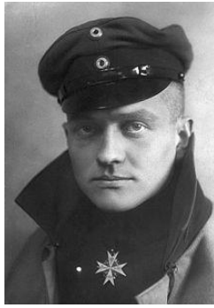
Richthofen wearing the Blue Max, Prussia's highest military order