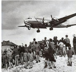
Berliners watch a C-54 skymaster land at Tempelhof Airport, 1948